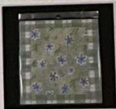
Large Crystal Clear Hanging Bags