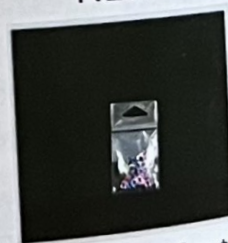
NEW!! Top Loading Crystal Clear Hanging Bags

Over 400 Sizes and Styles of Crystal Clear Packaging