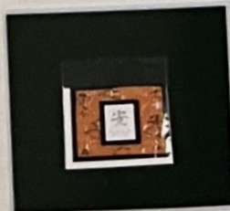
Crystal Clear Bags