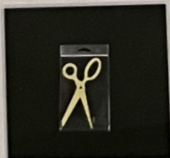
Small Crystal Clear Hanging Bags